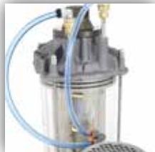
Self cleaning operation