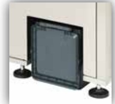
Bin location within the footprint

Higher capture rate - High capture rates improve the quality of the "grey water" going to drain (less suspended solid particles), aiding local water authority approval.