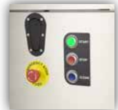
Visual control panel